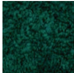
HUN - HUNTER