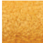
KAR - KARAT