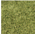
CYP - CYPRESS