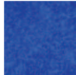
RBL - MARINE