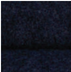
BLK - ONYX