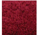
BUR - REDWOOD