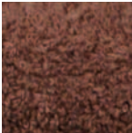
CCO - COCO

*** Indicate 3 character color code below.