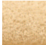
NAT - NATURAL