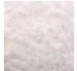
WHT - WHITE